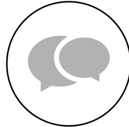
Active Social Media Users